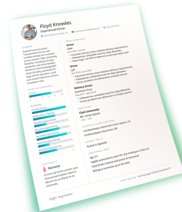
At CareersinCannabis , you can create a free, good-looking resume in minutes.

Include your highest level of education, any relevant certifications or training, and institutions attended, even if not directly related to cannabis job roles.